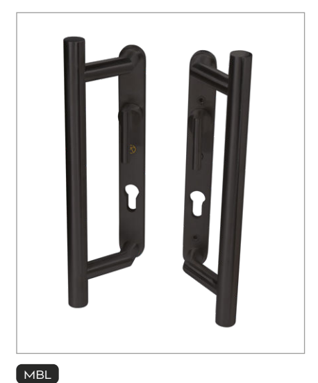
Matt Black Lacquer