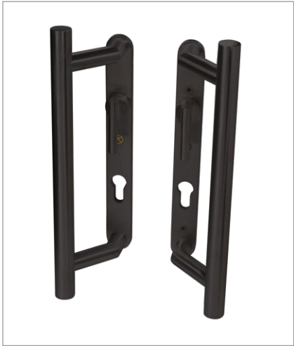
MBL Matt Black Lacquer