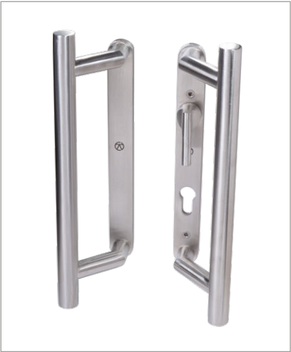
SSS Satin Stainless Steel