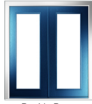
Double Doors (example: Full Glazed)

Choose from any of the 48 door styles shown on page 1. Some door styles will have size restrictions. See example below: